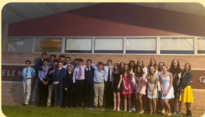
SLTG Class of 2022