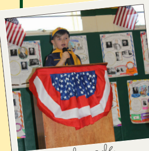
3rd grade presidents tea