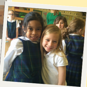
1st grade fun