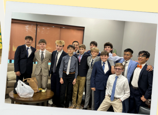
class of 2026