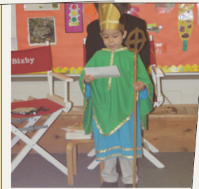
all saints day