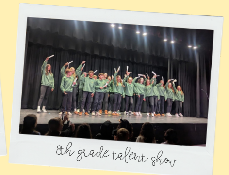
8 th grade talent show