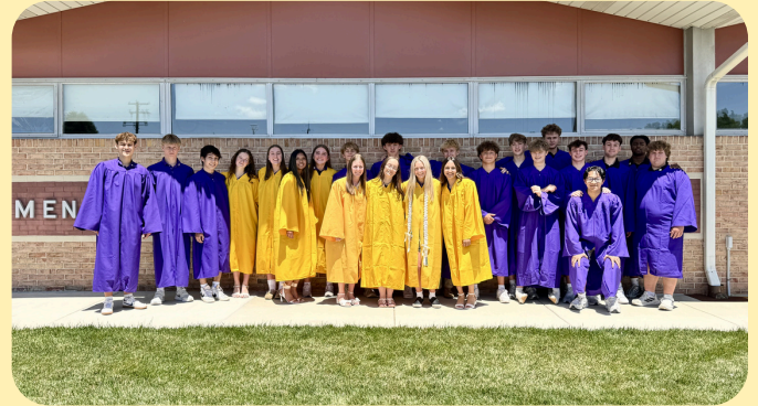
SLTG/LCHS Class of 2026

We are incredibly proud of these young men and women and all they have accomplished. We congratulate the Lancaster Catholic High School Class of 2026 and pray that God continues to guide them as they begin the next chapter of their lives. May they continue to carry with them the values, faith, and spirit of Saint Leo wherever their journeys lead.