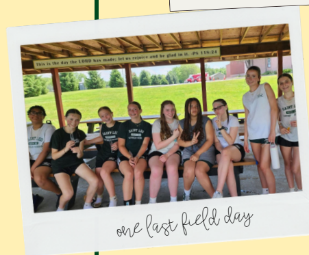
one last field day