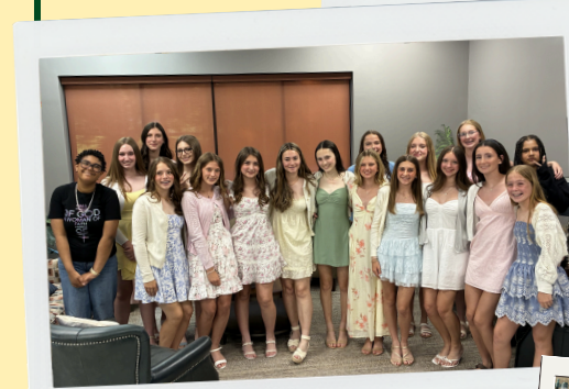
class of 2026