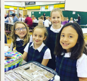
lunch with friends